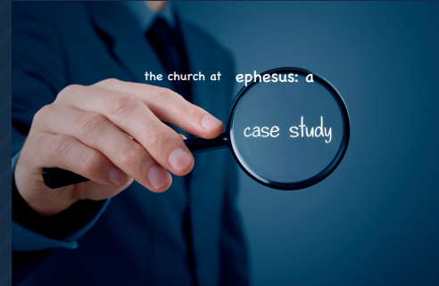
Over 70% of Preachers Surveyed have preached a series from Ephesians in the last two years

Ephesians is a monument to Inspiration of the Scriptures. No man could have on his own written such a comprehensive examination of the glorious riches of God's inheritance for His People, a more complete compact on the church of the Lord, and a guidebook for living in relationship with Him and with each other.